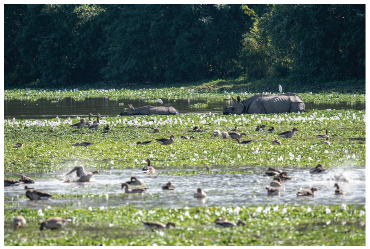
Photo 12: Swamps are popular places for huge numbers of waterfowl and big mammals, such as the rhino. Not only for feeding but also for washing and cooling down on warm days.