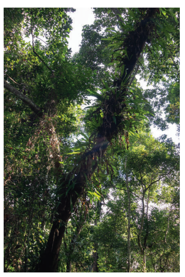
Photo 35: For epiphytes, such as orchids, growing on trees enables them to receive light and benefit from the forest's moisture-laden air.