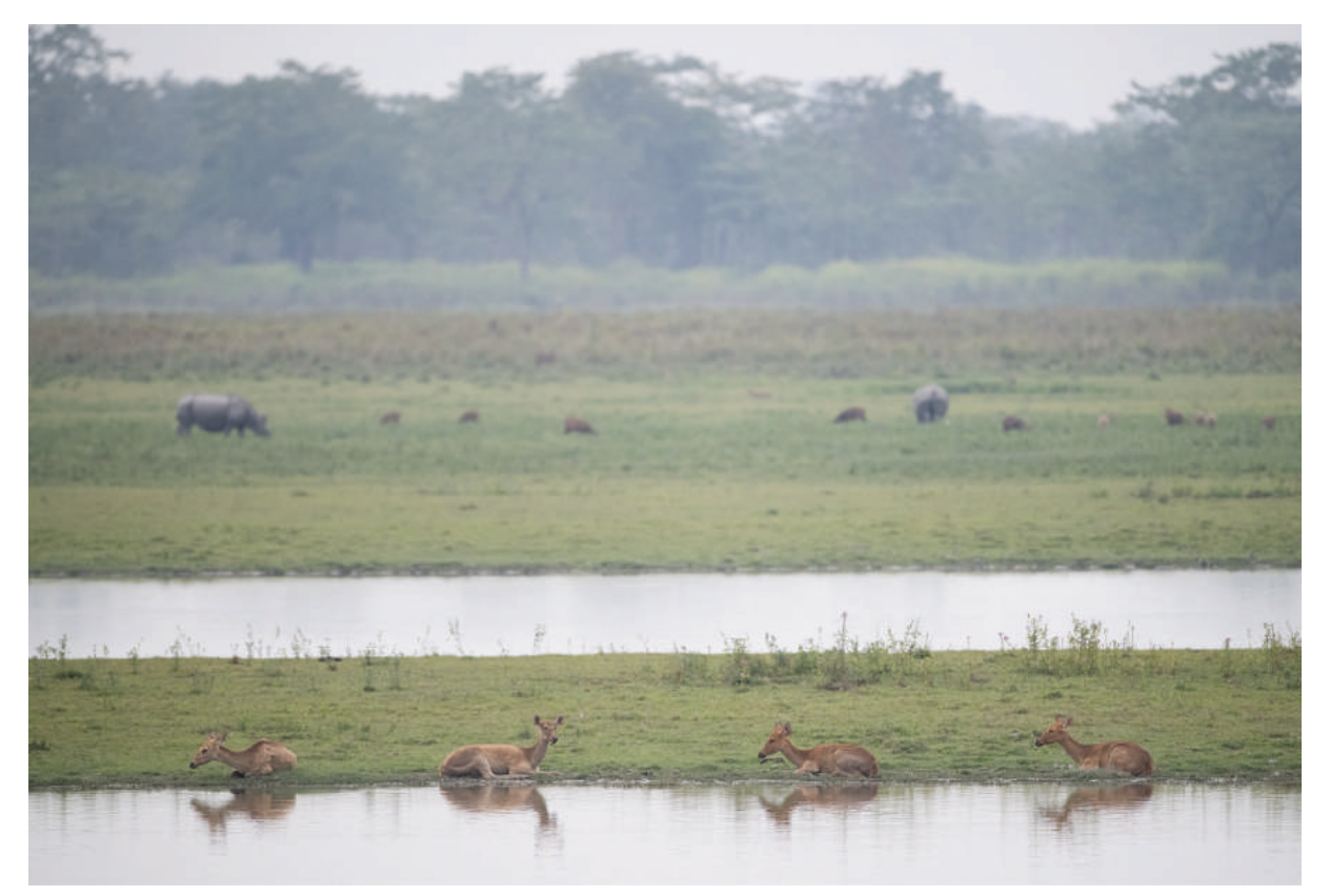
Photo 28: Eastern swamp deer and Indian rhinoceros (both IUCN category: vulnerable) in low-grass vegetation at a river shore.