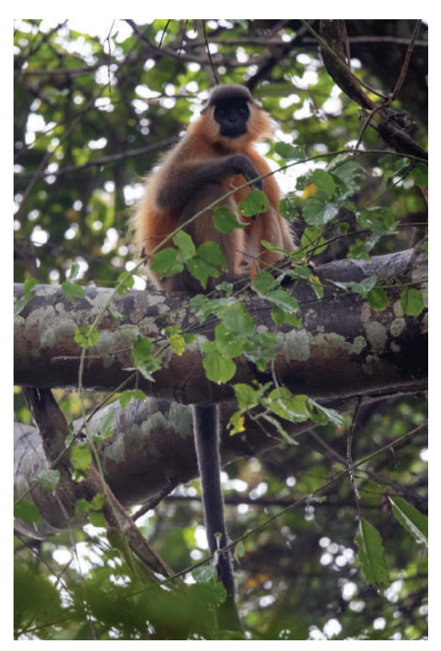
Photo 34: The capped langur (IUCN category: vulnerable) is a vegetarian, eating leaves, twigs, buds, and fruits. This arboreal and gregarious species may be seen in tropical dry forests.