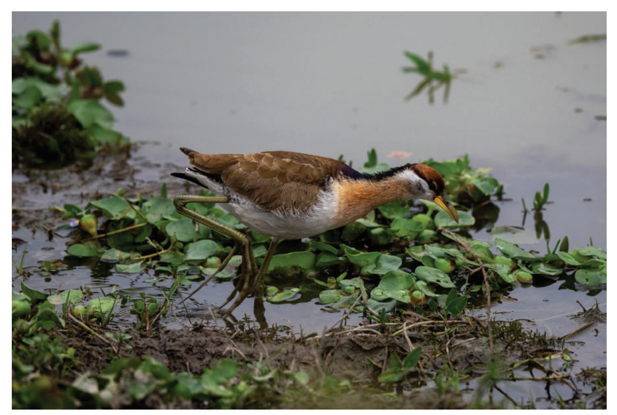
Photo 20: Its long toes make the bronze-winged jacana perfectly adapted for walking on floating vegetation.