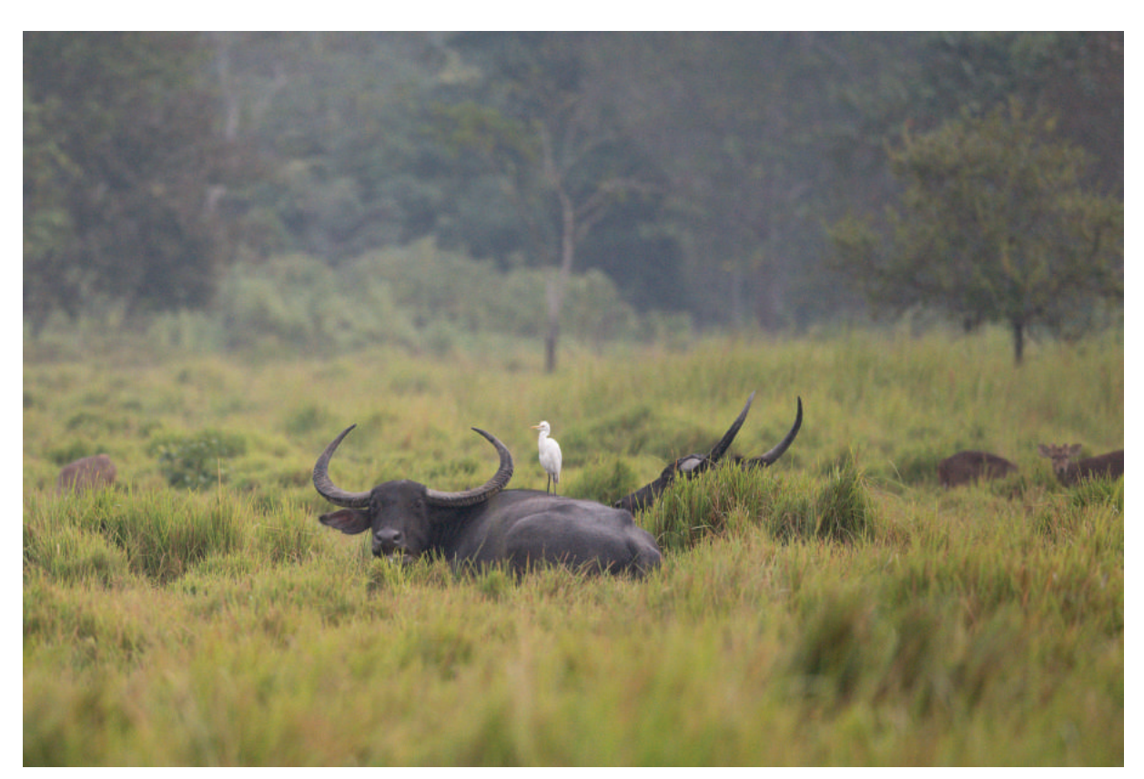
Photo 29: Wild water buffalo (endangered) resting and ruminating in tall-grass vegetation. Around 57 per cent of this buffalo species' world population lives in Kaziranga National Park.

Photo 28: Eastern swamp deer and Indian rhinoceros (both IUCN category: vulnerable) in low-grass vegetation at a river shore.