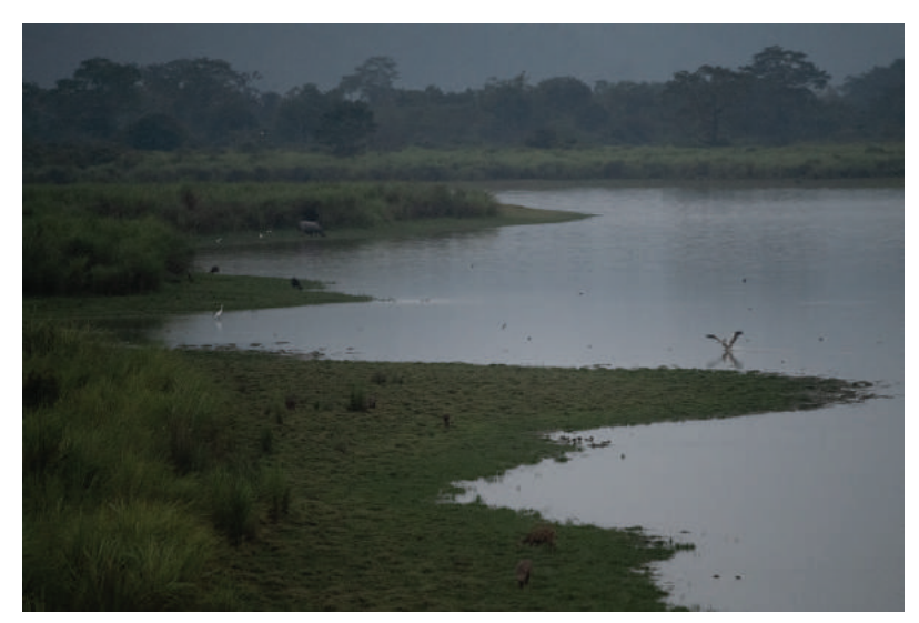
Photo 21: Example of a typical transition from open water to low- and tall-grass vegetation and forest.