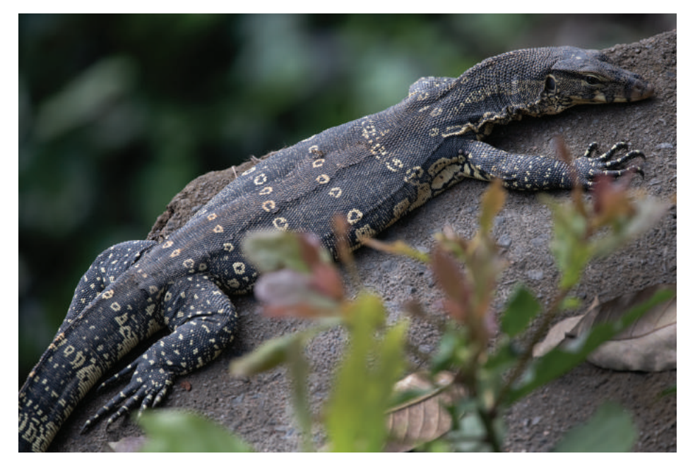
Photo 8: Asian water monitor resting on a stone next to one of the many waterbodies.

Photos 6–7: River courses and riverbanks are highly dynamic. Strong river currents and flooding in the monsoon season may be both detrimental and creative; on the one hand, large areas are eroded and intact terrestrial ecosystems are washed away. On the other hand, sedimentation processes create new habitats and waterbodies that are crucial for plant and animal life.