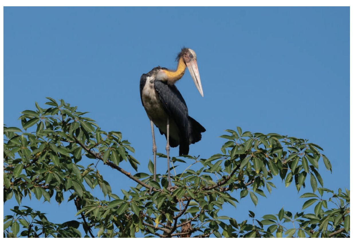
Photo 26: Lesser adjutant stork ("IUCN category: near threatened" i.e., it is likely to become threatened in the near future).