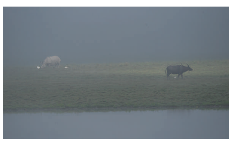
Photo 22: Waterside grasslands can be characterized by low-grass vegetation kept short by herbivore grazing and flood events.