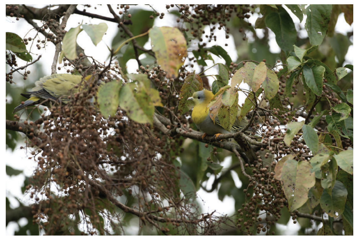
Photo 31: The yellow-footed pigeon is well camouflaged among the leaves. How many can you see?