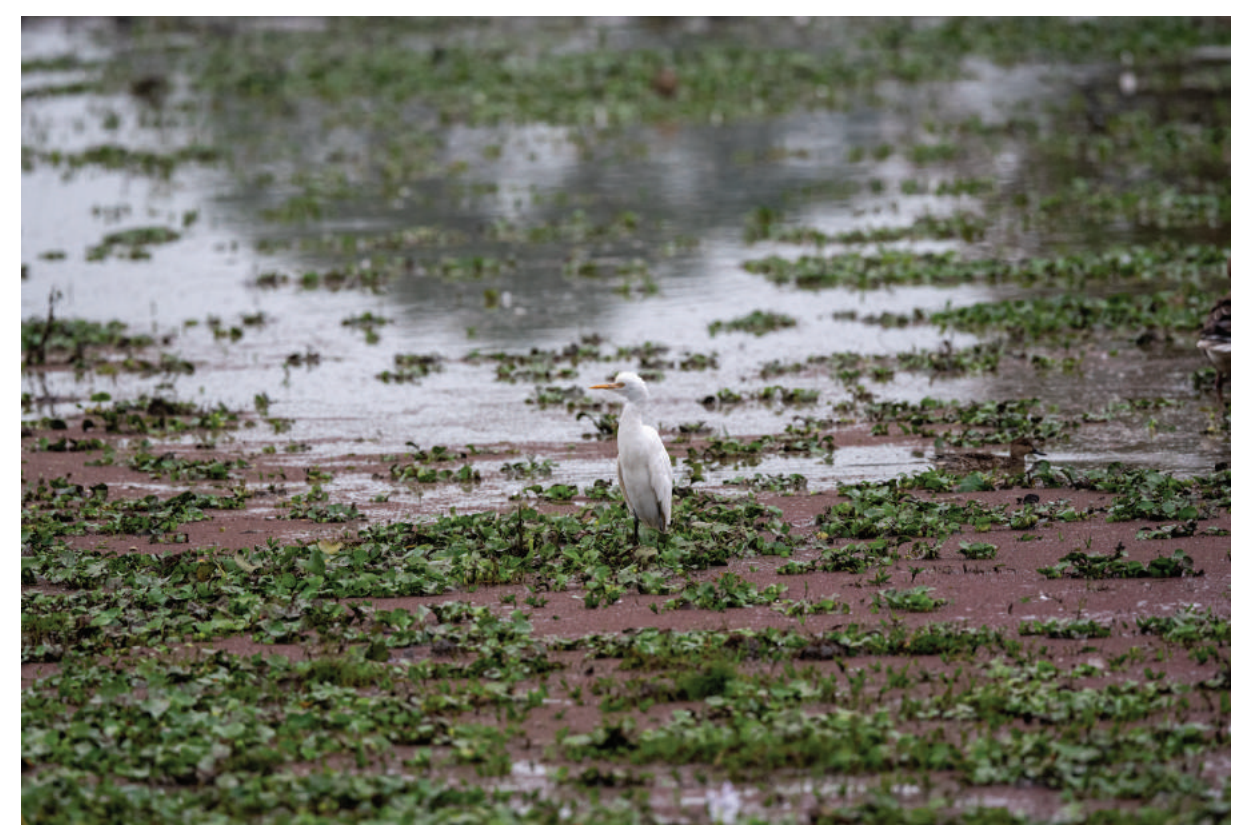
Photo 13: Standing waterbodies like ponds may become completely overgrown by aquatic plants like water hyacinths, water lilies, and lotuses. Once overgrown, these swamps serve as excellent grazing areas for mammals (see images below).

Photo 12: Swamps are popular places for huge numbers of waterfowl and big mammals, such as the rhino. Not only for feeding but also for washing and cooling down on warm days.