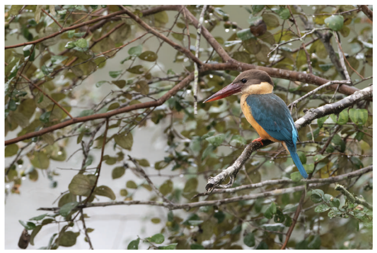
Photo 9: The stork-billed kingfisher is one of four species of kingfisher in Kaziranga. Here it is, looking out for its next small-fish prey in the river.