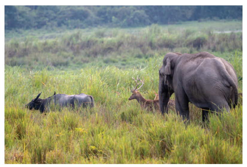
Photo 23: Three 'friends' lining up to graze in the tall grass. Left to right: wild water buffalo, Eastern swamp deer, and Asian elephant are all listed as endangered in the IUCN Red List of Threatened Species (very high risk of extinction).

Photo 22: Waterside grasslands can be characterized by low-grass vegetation kept short by herbivore grazing and flood events.