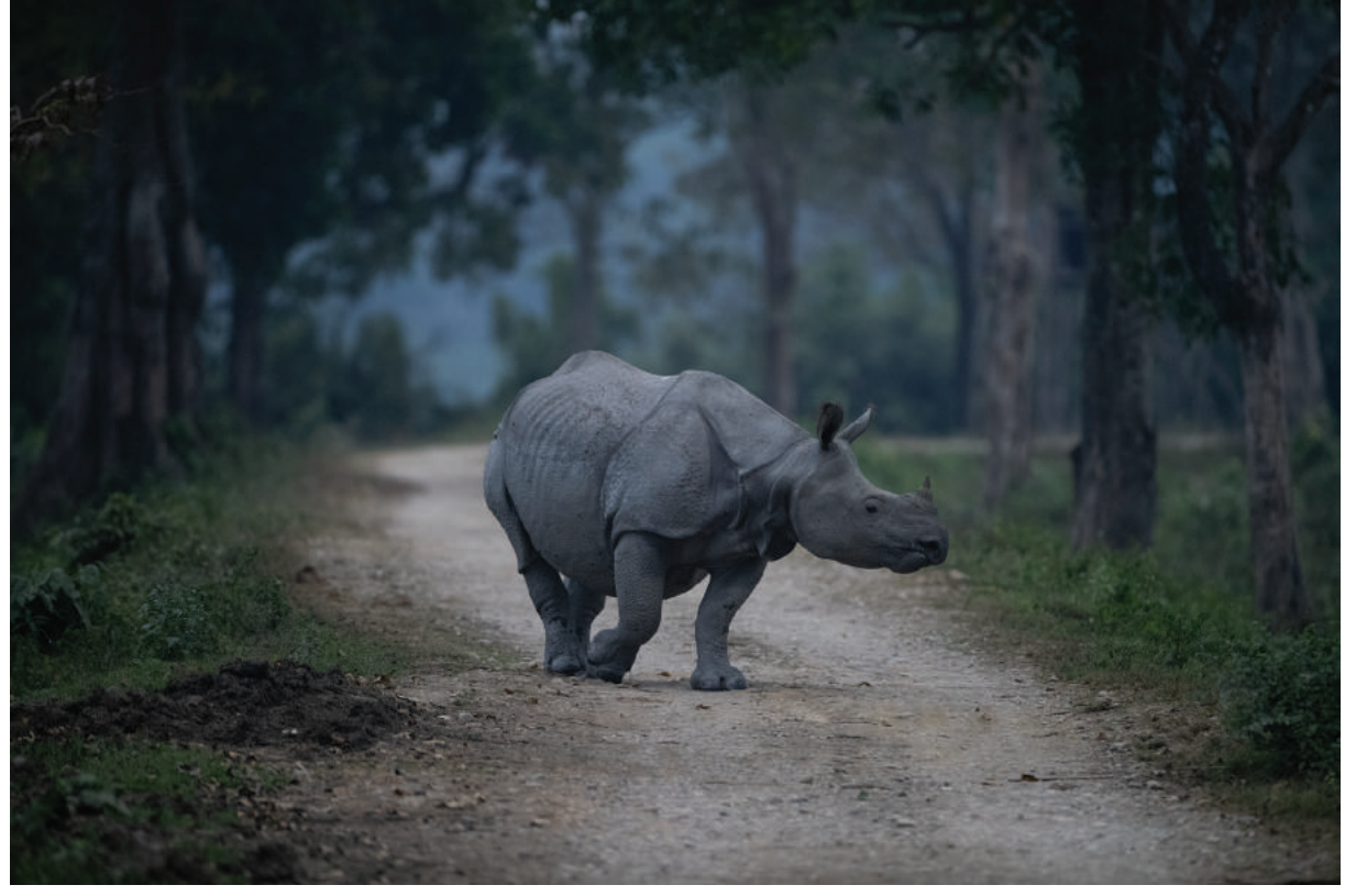
Photo 5: A rhino crosses the road where small, open Suzuki jeeps transport pale tourists from the north (the authors) with expensive lenses.

Also rivers and waterbodies are essential for the greater one-horned rhinoceros or great Indian rhinoceros. With more than 2,000 individuals, the population in Kaziranga National Park is the largest in the world. The IUCN Red List of Threatened Species categorizes the rhino as vulnerable, indicating a high risk of extinction in the wild.